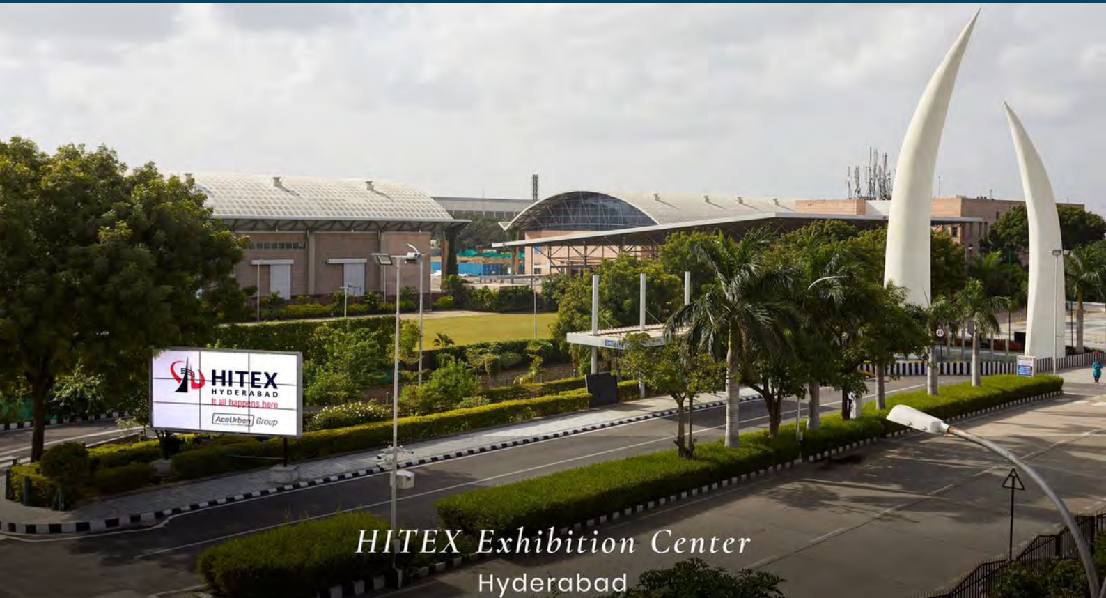
HITEX Exhibition Center Hyderabad